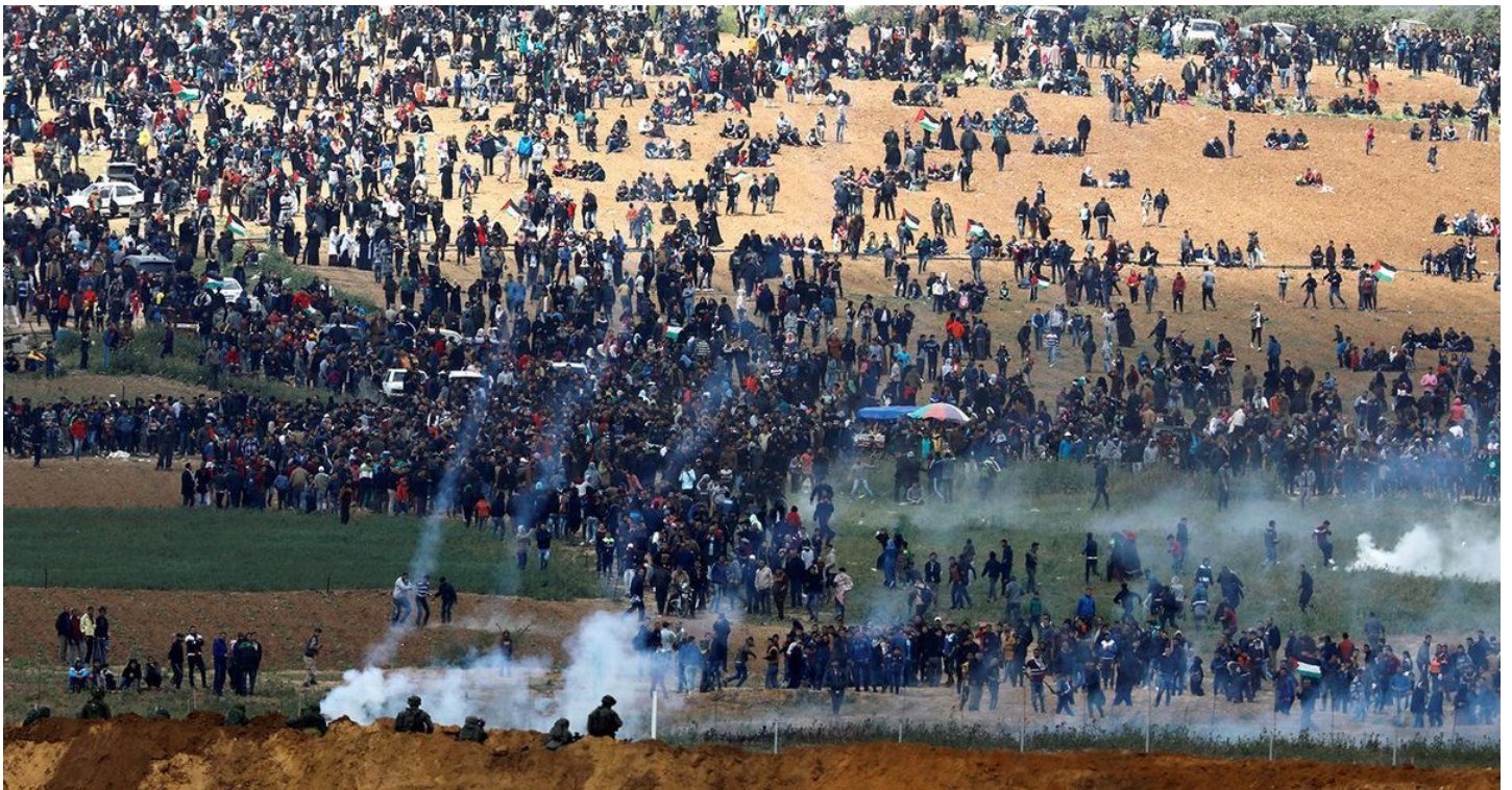
Israeli soldiers shoot tear gas shells at Palestinians protesting in Gaza on March 31

The members of an Indian delegation who were allegedly not let into Palestinian territories by Israeli authorities have written to Prime Minister Narendra Modi, claiming that the “government’s appeasement of Israel has only augmented Israeli arrogance, high-handedness and discourtesy in dealing with Indian citizens holding valid passports and valid visas to visit Palestinian National Territory”.