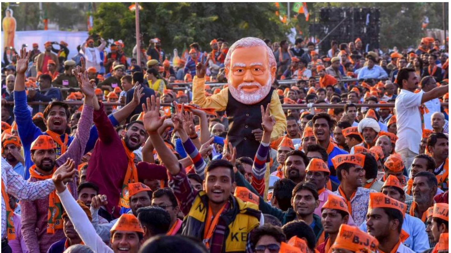
BJP supporters in Rajasthan.

Given the supernatural aura conjured up around Modi, it is only natural that the masses get brainwashed into believing that he is their saviour. This transfers Modi and the voters from the realm of politics into the realm of religion. In comparison with this, the erstwhile ‘communal politics’ was a minor rash on the skin; whereas this is a killer version of galloping cancer.