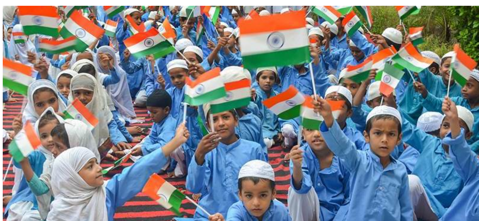
Students wave Tricolours during the 72nd Independence Day celebrations, at Jamia Naeemia Madarsa in Moradabad.

The brand of politics that Modi and Shah have invented is only inadequately described as politics of communal polarisation. We Indians must beat back this surging national calamity.