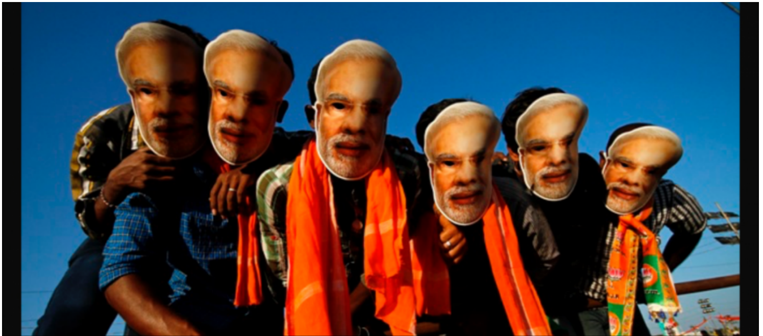
Modi supporters.

This pie-in-the-sky-when-you-die sort of religion is an invention of the hypocritical purveyors of religion, who were hand-in-glove with the rich and the mighty. You cannot proffer the pie in the sky to a corporate giant. He will laugh you out of the court if he doesn't set his German shepherds on you. He doesn't care how short, or long, your short-term pain is. He is happy so long as he has all the short and long-term gains. By now it is abundantly clear that the common man's pain has been converted into the corporates' gain. It's a small wonder how the number of billionaires is increasing like in a fairy tale in India. The poor are left with their pains.