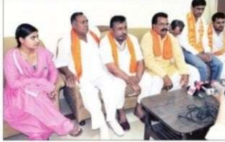
जींद में पत्रकारों से बात करते हिंदू महासभा पदाधिकारी।

उसको करनी है तो वह भगवा चोला छोड़ दे। भगवा चोले की देश में इज्जत होती है। ऐसे स्वामियों को खुले में रहने का भी कोई अधिकार नहीं। उन्होंने कहा कि देशद्रोही मसरत अली को तिहाड़ जेल लाया जाए क्योंकि जहाँ पर वह बंद है वहाँ पर उनकी खातिरदारी धर की तरह हो रही है। उन्होंने कहा कि गिलानी जैसे अलगाववादी नेताओं की सुरक्षा हटाई जाए। वह कोई देशहित में नेता नहीं बल्कि एक आतंकवादी है। उन्होंने देश व प्रदेश में बढ़ती रेप की घटनाओं पर चिंता प्रकट करते हुए कहा कि भड़कीले कपड़े इसके लिए जिम्मेदार हैं। कालेजों में ड्रेस कोड हर हाल में लागू हो। इसके लिए सरकार व कालेज प्रबंधक इस मामले में गंभीर हो। उन्होंने कहा कि हिंदू महासभा ने कालेजों में ड्रेस कोड लागू करवाने की मुहिम चलाई है जिसके चलते कई कालेज प्रबंधकों ने हाफ जींस पर प्रतिबंध लगाते हुए अपना ड्रेस कोड लागू