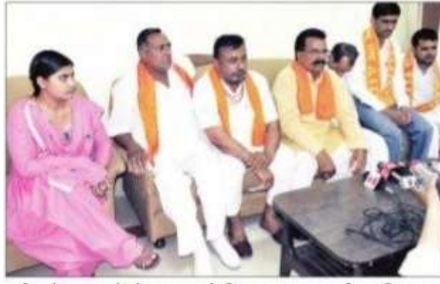
Hindu Mahasabha leaders speaking to the Press

On April 18 th Swami Agnivesh had visited Srinagar, Kashmir to express his fullest solidarity and to participate in a first ever 30 hour long fast dharna by JKLF leader now turned peace activist Yasin Malik. Top leaders of Kashmiri Pundits, Sikh community leaders and a well-known Christian priests joined hundreds of Kashmiri youth and raised slogans Saath Jiyenge Saath Mareng ( We will live and die together) imploring migrant Pundits to return to their original home and hearth. Reacting viciously to this moving gesture of Swami Agnivesh, the Hindu Mahasabha in Jind Haryana made a violent and unconstitutional declaration that whosoever shall chop off the head of Swami Agnivesh would be rewarded INR. 500000 ( half a million rupees)